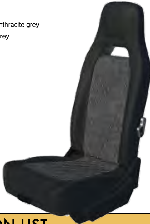
A) Leather anthracite grey B) Medium grey