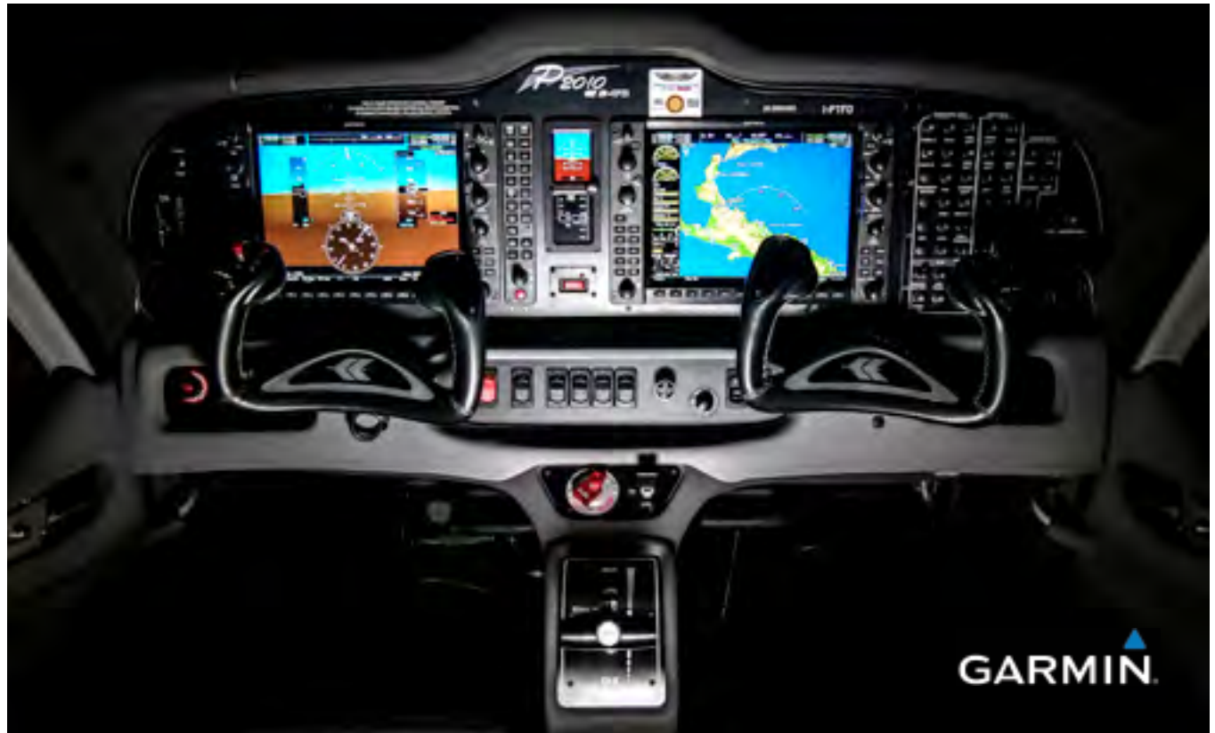
Options also as pictured

Hydraulic Toe Brakes Parking Brake Electrical Flaps Dual Flight Controls Castering Nose Wheel Ailerons Lock and Elevator Lock Flight Trim Controls: • Rudder with Indicator • Stabilator with Indicator Engine Controls: • Throttle • Alternate Air Fuel Control Selector with LH/RH/OFF