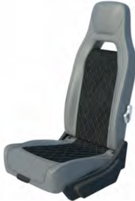
A) Leather anthracite light grey B) Anthracite grey

Standard Interior comes with blue seats and ivory cabin.