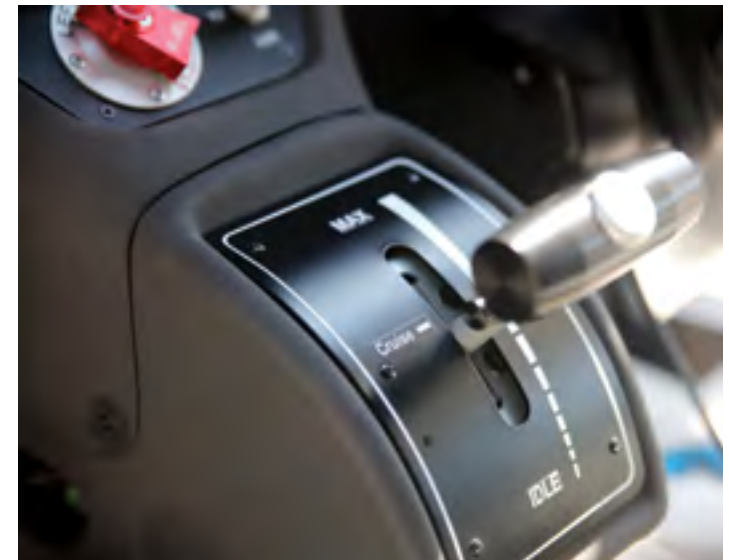
Central Engine PWR lever